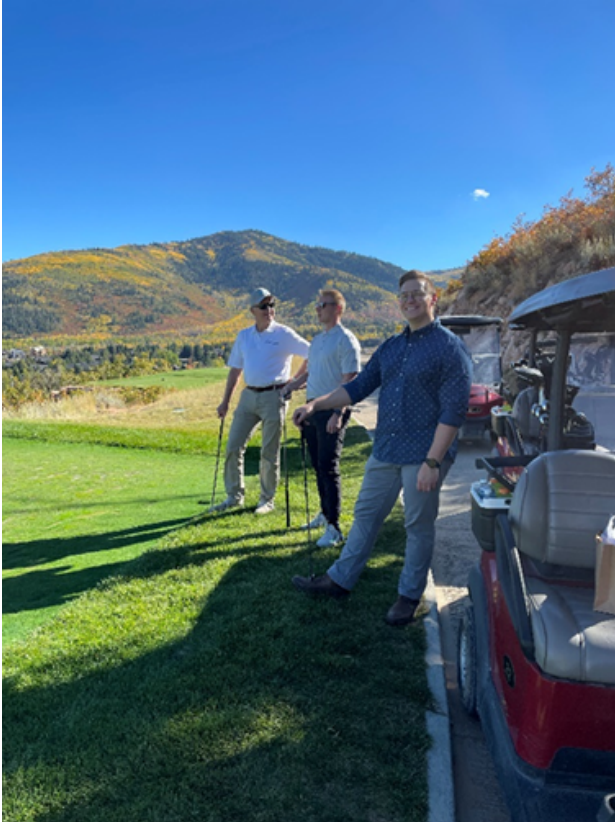
Enjoying Canyons Golf course