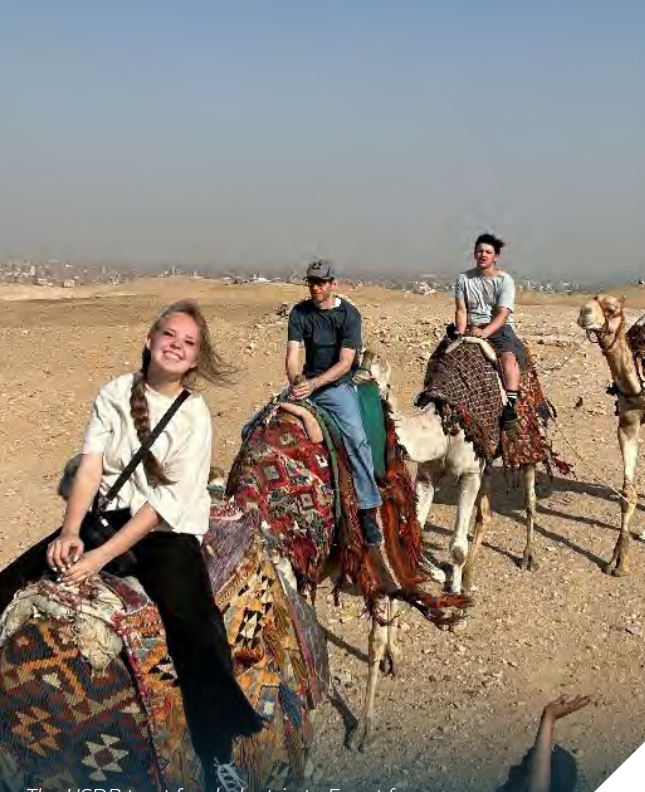
The USDB trust funded a trip to Egypt for a group of deaf and hard of hearing students