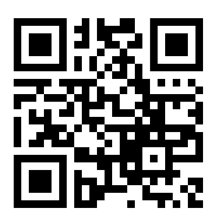
Advocacy Office website