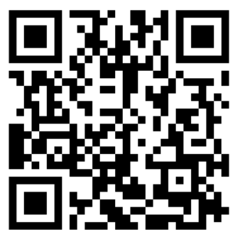
Miners Hospital video

Trust fund distributions sent to the Miners Hospital program at University of Utah Health provide funding to treat patients with mining related injuries and illnesses.